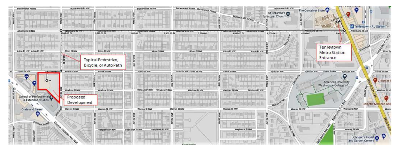
Exhibit 5. Distance to the nearest Metro station (Tenleytown), as measured by Google Maps (5,242 feet or 0.99 miles).